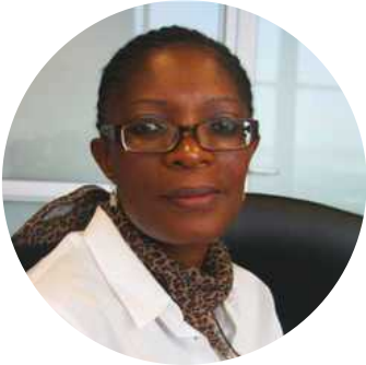
MMADITONKI SETWABA, ACTING DEPUTY DIRECTOR-GENERAL, TOURISM SECTOR SUPPORT SERVICES

Speaking on behalf of the Minister of Tourism: