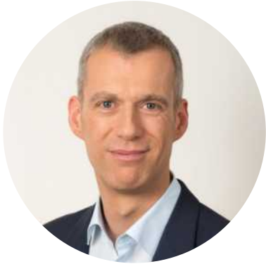
KAI HATTENDORF, MD/CEO at UFI, THE GLOBAL ASSOCIATION OF THE EXHIBITION INDUSTRY

The exhibitions and events industry has taken a huge hit as a result of the COVID-19 virus. The revenue generated this year has contracted to 30% comparatively with 2019 revenue; 1.9 million jobs have been affected globally across exhibition and tourism related activities; and almost 300-billion USD business contract value between participants of exhibitions has not been generated.