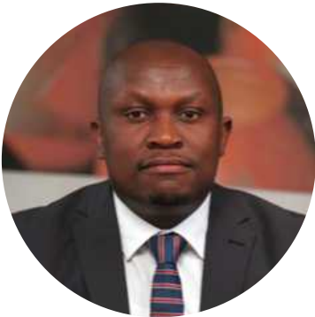
TSHIFHIWA TSHIVHENGWA, CEO, TOURISM BUSINESS COUNCIL OF SOUTH AFRICA